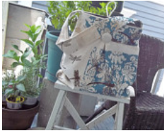
Robins Egg Blue Market Bag Set - Dragonflies - Hand Printed